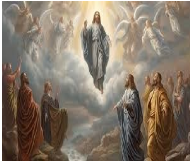
The Ascension of the Lord Cycle B