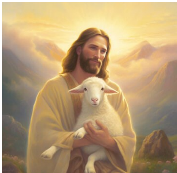
Sixth Sunday of Easter Cycle B